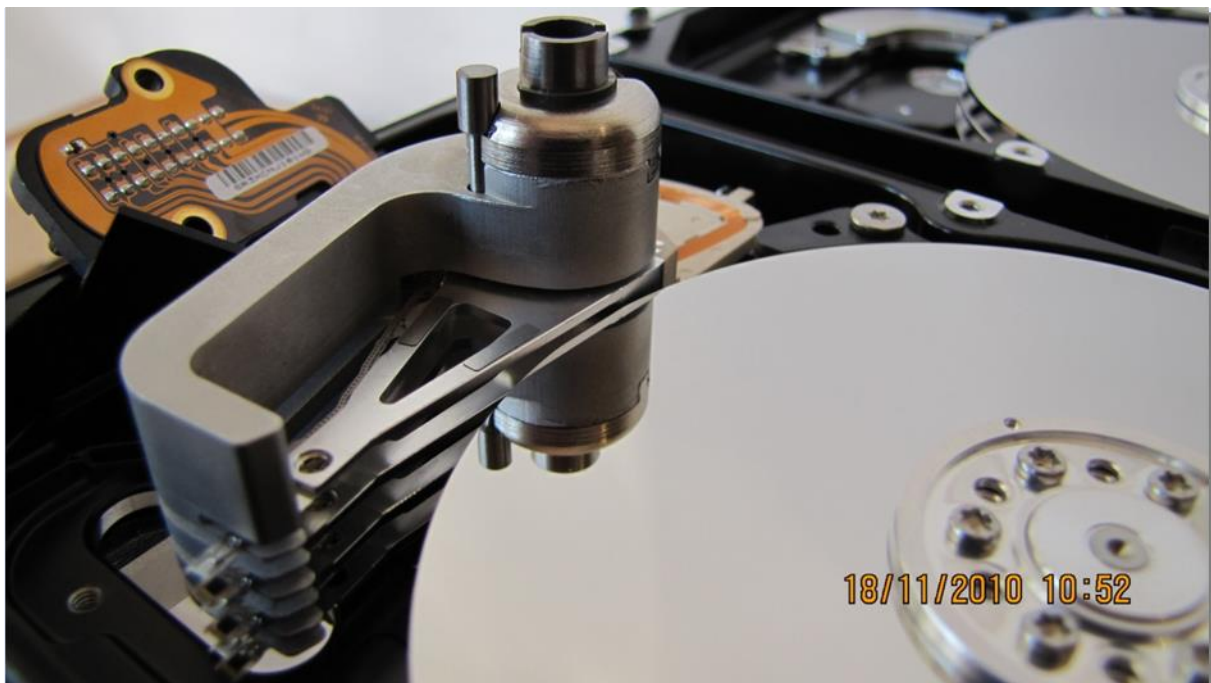
Picture 5. (moving secured tool with heads outside of platters area)

By vertical scrolling move the tool (previously secured by pin) to the initial position.