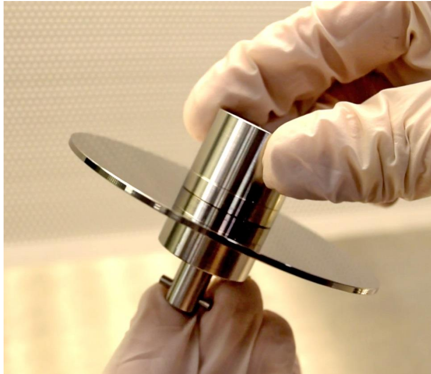
Picture 4.2. Position of the platter in the Platter Carrying Assembly

After the platter is properly positioned on the lower shell, gently wind down the upper shell until you sense it touching the platter. Repeat this procedure for every Platter Carrying Subassembly . The platter is secured between the lower and the upper shell like on the picture below.