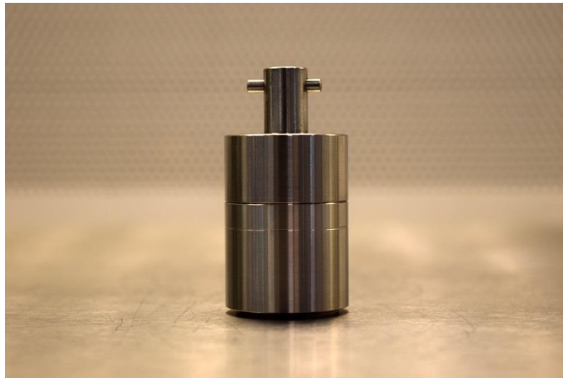
Picture 2.2. The Platter Carrying Assembly

Upper shells are marked with a number of engraved rings, helping the data recovery specialists differentiate them thus disabling the possibility of mixing up the order of the platters stored in the Platter Carrying Assemblies .