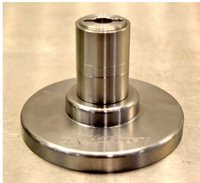
Picture 3.2. Base with the added Platter Carrying Assembly

Start with the base. Attach the first Platter Holding Assembly into the hole in the middle of the base. After this point, it is all about stacking the Platter Carrying Assemblies atop of one another.