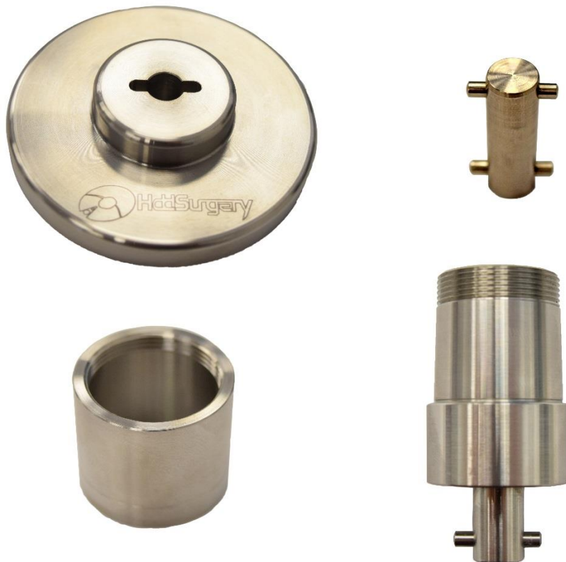
Picture 2.4. Platter Stand Tool Part List